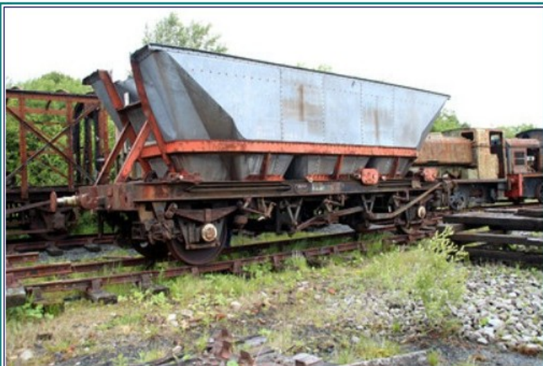
BR 354456 MGR Coal Hopper built 1968