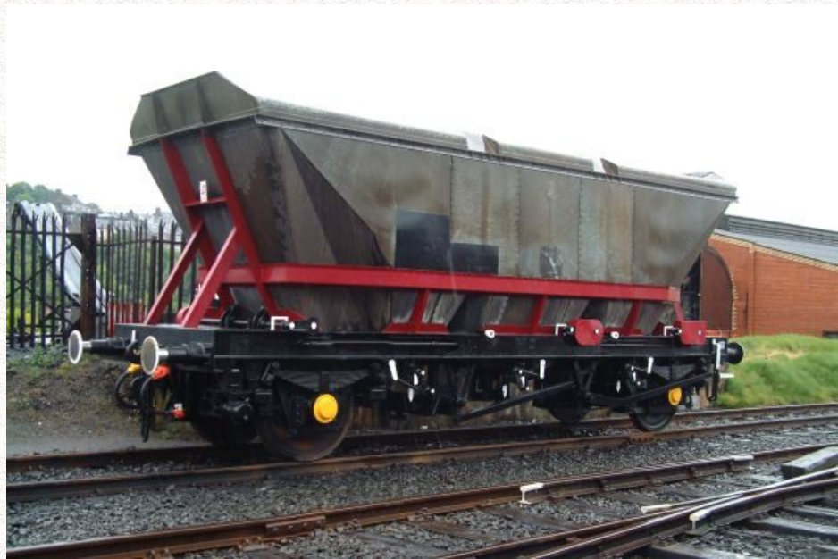
Built 1964, BR Darlington, Diagram 1/156. Roller bearings, air brake. SRPS Core Collection, EWS livery.

This is the prototype MGR wagon type HOP 32AB, in which description "HOP" refers to the hopper design, "32" indicates the capacity in tons (achieved by utilising the volume of the top canopy) and "AB" refers to the air brake. The later TOPS designation of this variant of the MGR wagon is HCA - signifying that the wagon has a canopy and can run at 45mph loaded and 60mph empty in block formation.