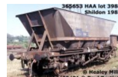
HAA 365653 at Healey Mills 12th May 2001.

For more pictures see the Links section at the bottom