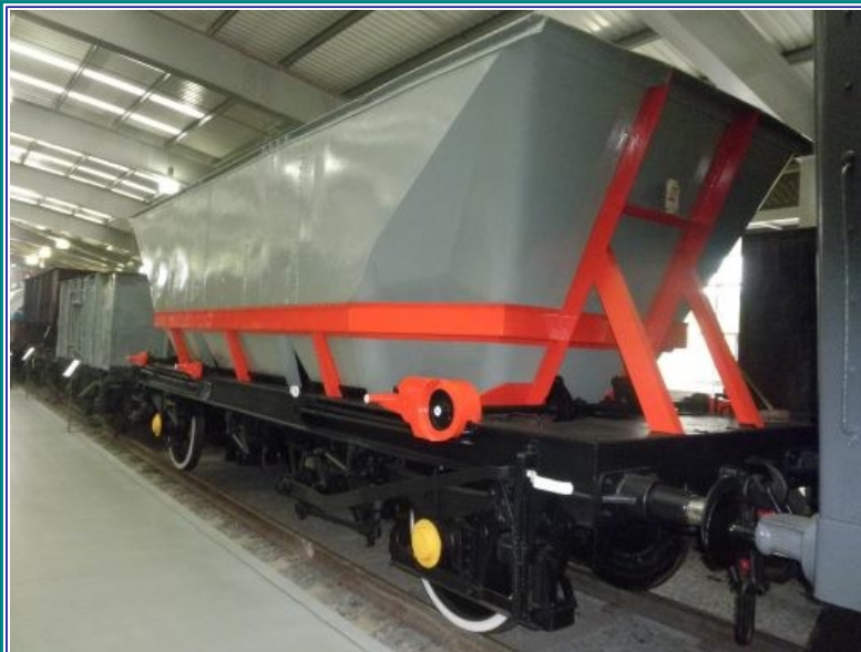
BR 350000 MGR Coal Hopper built 1964